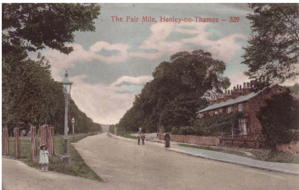
The Fair Mile in 1907