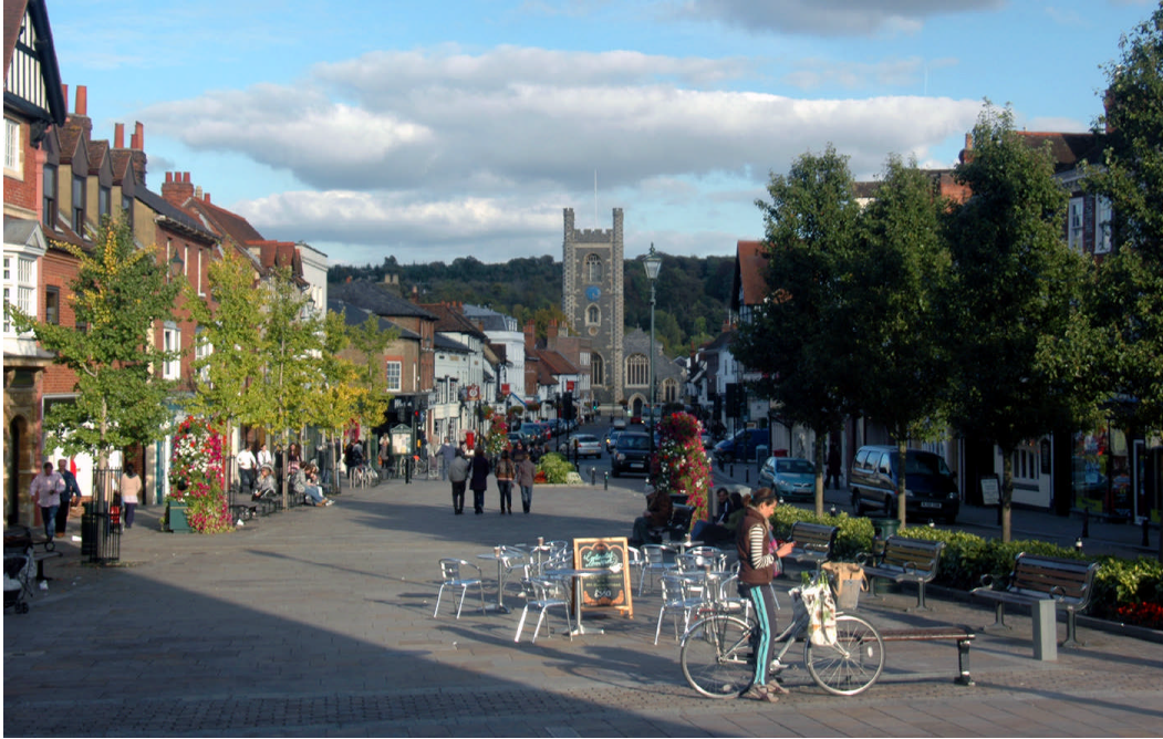
The Market Place looking towards Hart Street in 2009