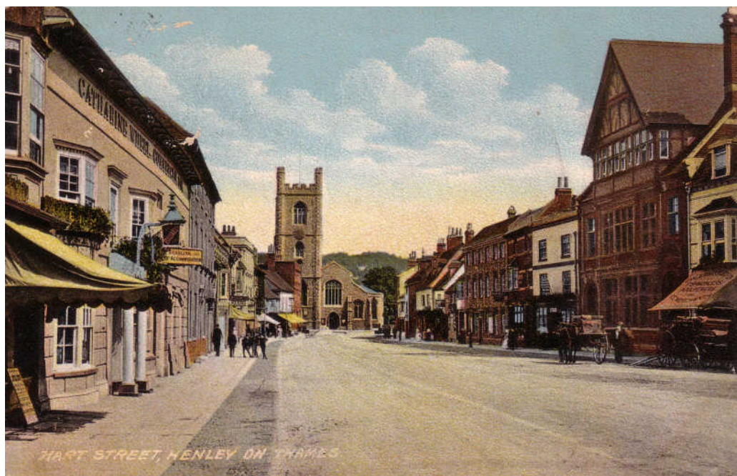
Hart Street in 1916