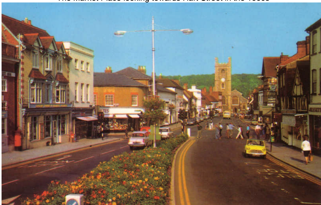
The Market Place looking towards Hart Street in the 1980s