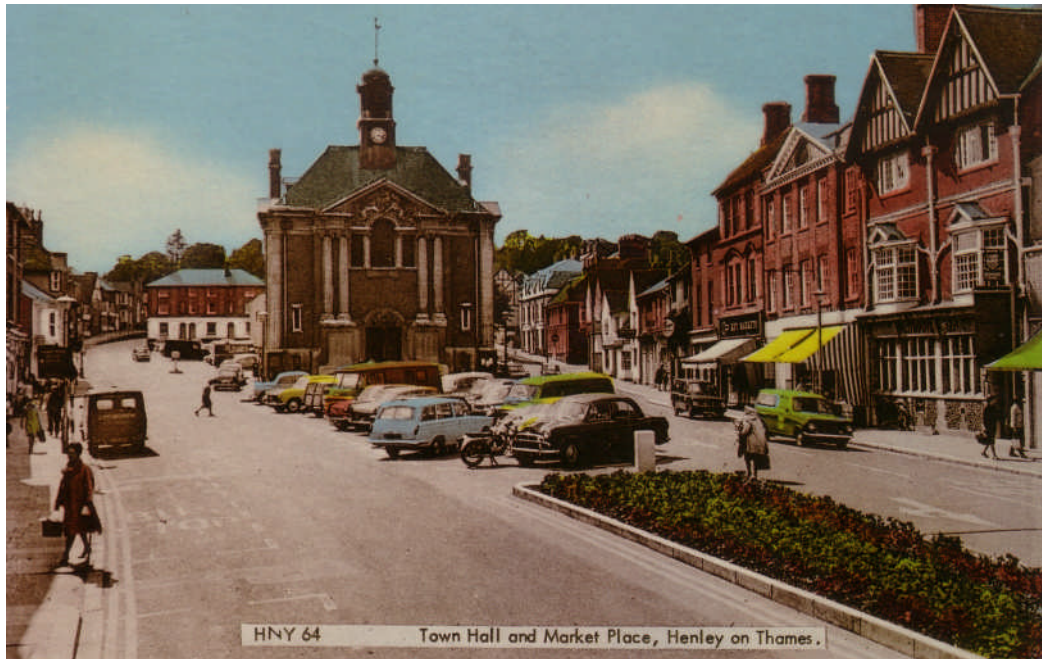
The Market Place in the 1960s