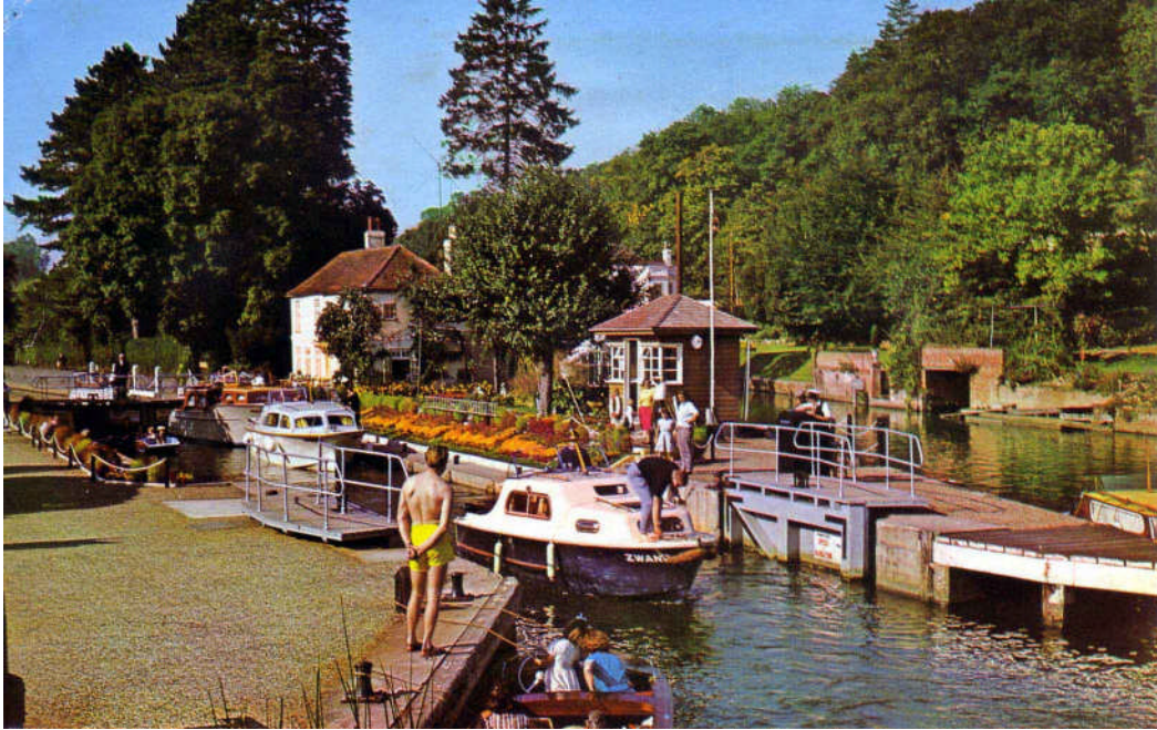
Marsh Lock in 1964