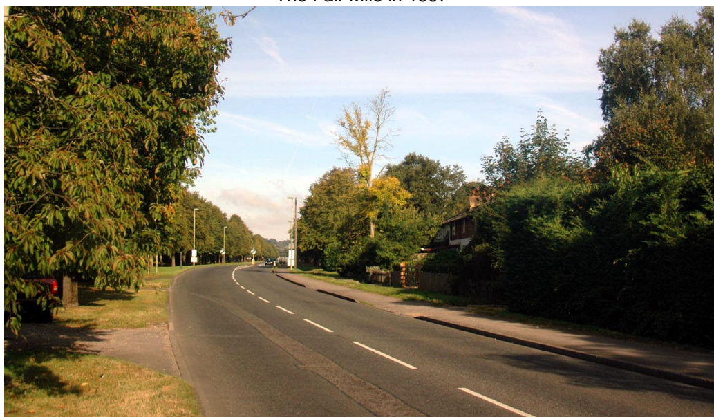
The Fair Mile in 2009