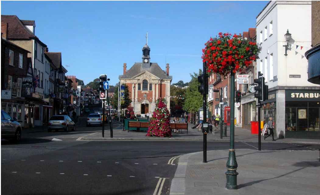
The Market Place in 2009