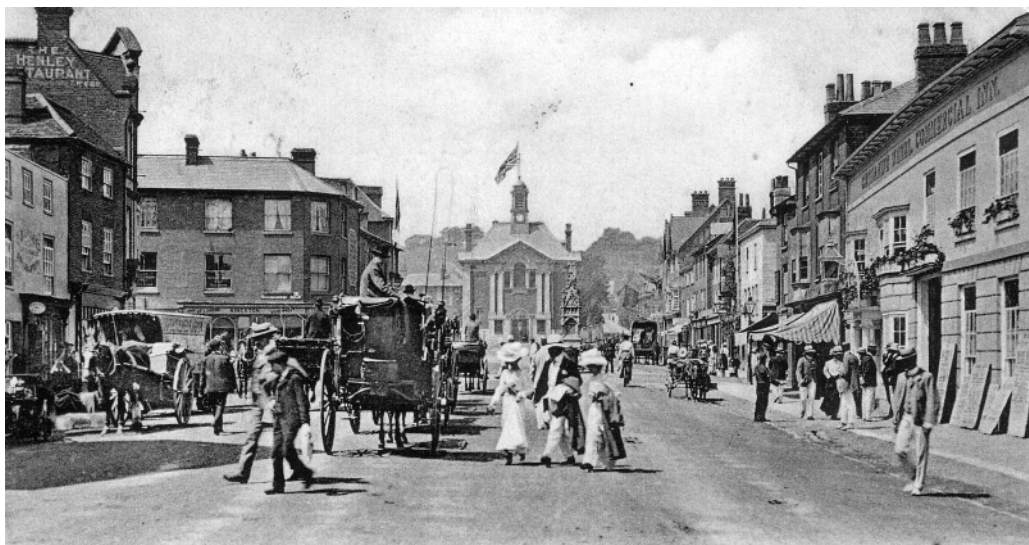
The Market Place in 1904