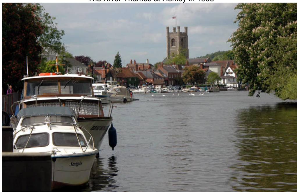
The River Thames at Henley in 2008