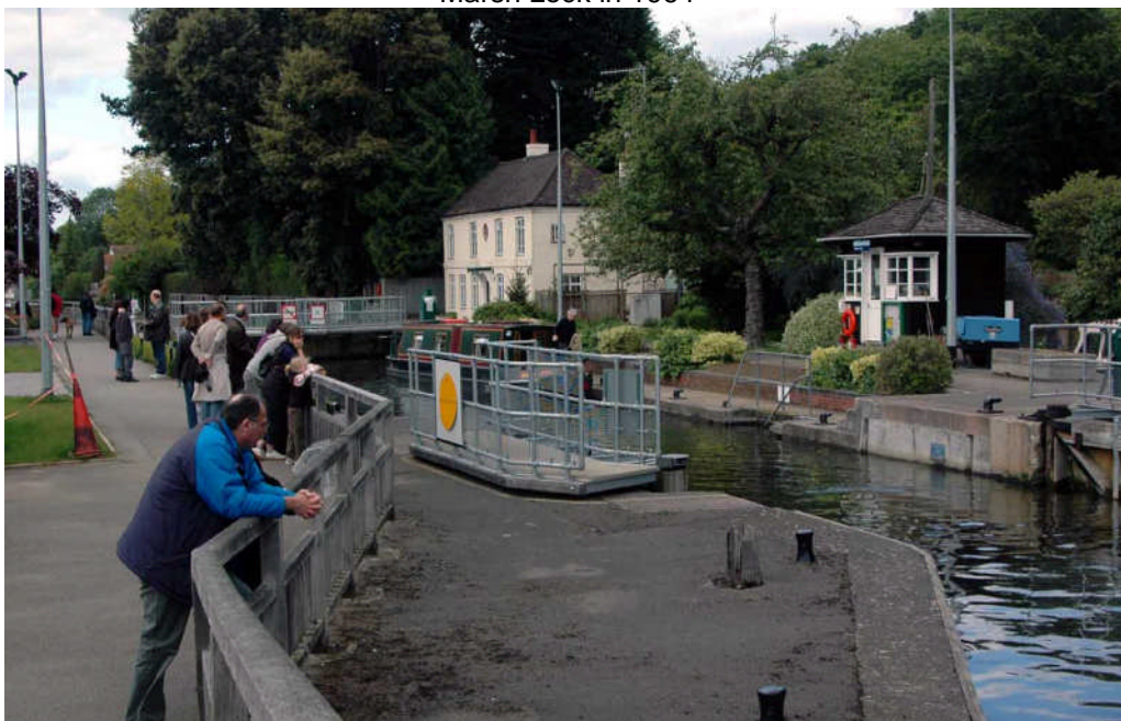
Marsh Lock in 2008