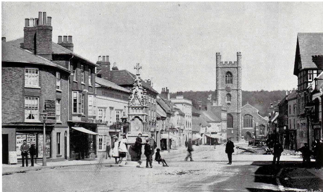
Hart Street in the 1890s