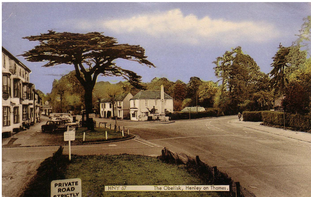
Northfield End junction with Marlow Road in 1967