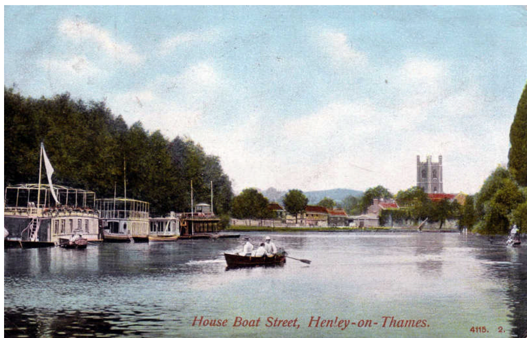
The River Thames at Henley in 1906