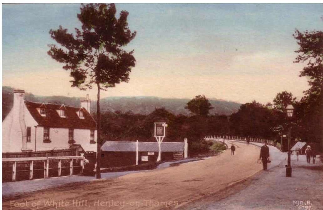
The Foot of White Hill in the 1900s