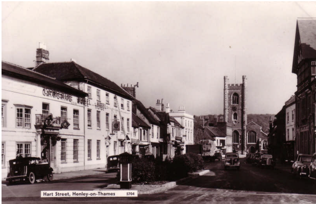
Hart Street in the 1960s