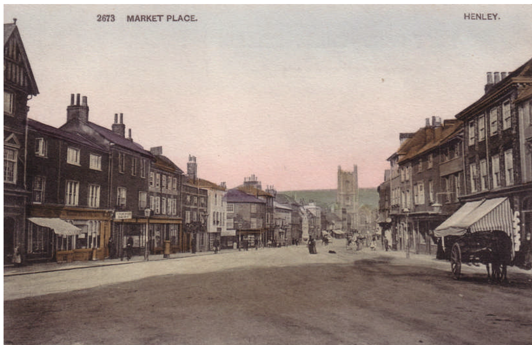
The Market Place looking towards Hart Street in the 1900s